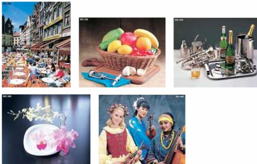
Figure 2 Test Pattern Used for Printing Photographs (Set of 5)